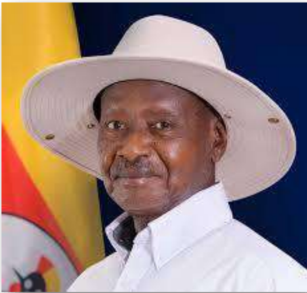
Figure 2- H.E. President Yoweri Kaguta Museveni

The Uganda Vice Chancellors' Forum joins the nation in congratulating H.E. President Yoweri Kaguta Museveni upon his victory in the recently concluded presidential elections. This milestone reflects the confidence that Ugandans continue to place in his leadership and vision for the country.