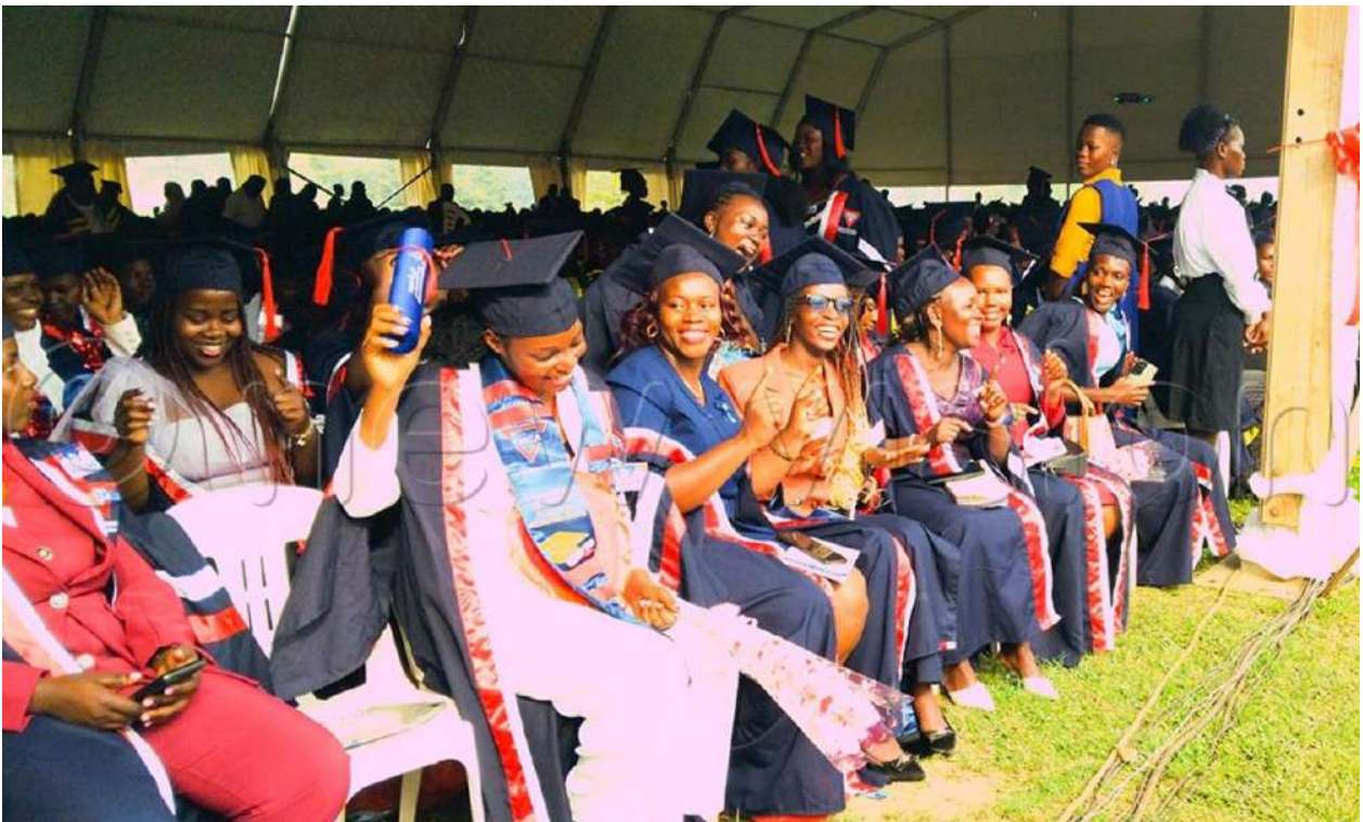
Figure 5YMCA Comprehensive Institute - Graduation

The event celebrated the institute's continued commitment to skills development and vocational education , with a notable majority of the graduates being female , reflecting growing participation of women in technical and vocational training