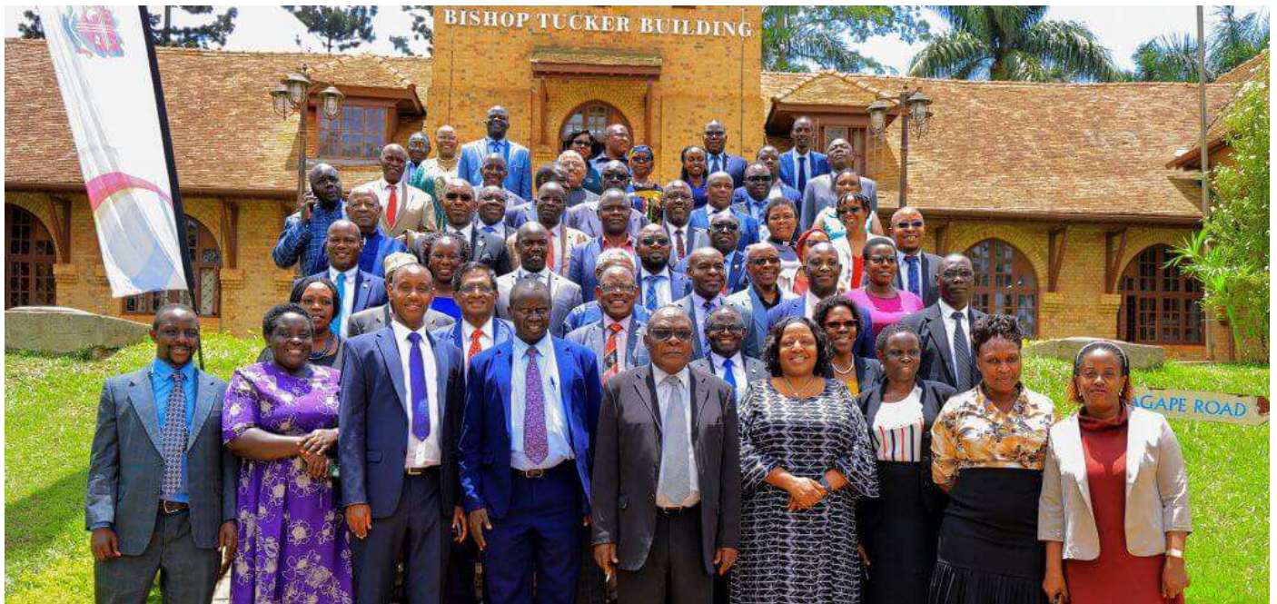
Figure 7- Vice Chancellors at the 77th General Forum Meeting held at Uganda Christian University - Mukono (UCU) On 16 th March 2026